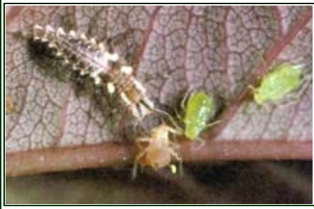
Figure 2. Green peach aphids with lacewing larvae predator.

Green peach aphid, Myzus persicae (Sulzer) (Figure 2), is found worldwide on a great variety of host plants. Green peach aphids are small, about 1/12 inch (1.8-2.3 mm) long, light to dark green or pink in color, with red eyes. Wingless forms are usually yellowish-green during the summer, but may be pinkish-red in the early spring and fall. Winged forms are generally brown with a yellowish abdomen bearing an irregular dark blotch. Green peach aphid is frequently migratory, moving from host to host. In the Southeast, green peach aphid is insignificant as a direct pest of peach. However, it is an abundant, cosmopolitan, migratory aphid with documented potential as a plum pox vector in other areas of the world. In most cropping systems, insecticidal control of migratory aphids to mitigate spread of