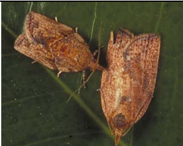
Light Brown Apple Moth