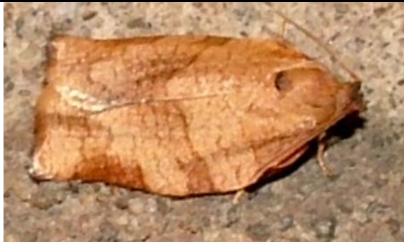
Oblique Banded Leafroller