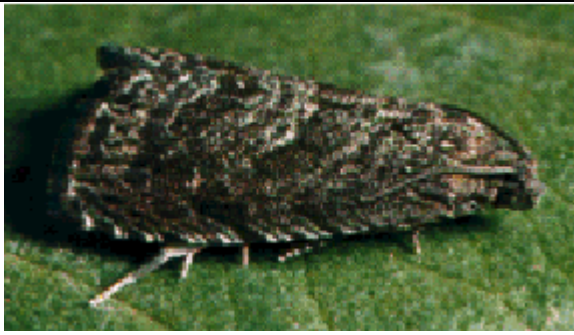
Oriental Fruit Moth