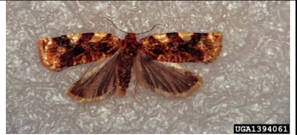
Fruit Tree Leafroller

Clemson University Cooperative Extension Service - United States Department of Agriculture